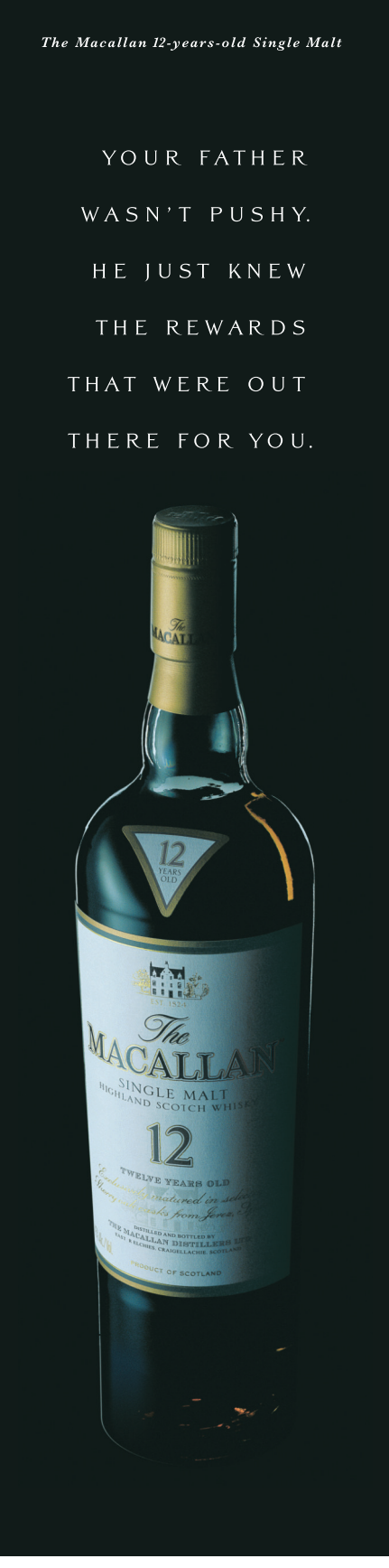
©2005 THE MACALLAN DISTILLERS LTD. THE MACALLAN® SCOTCH WHISKY 43% ALC./VOL. REMY COINTREAU USA, INC., NEW YORK, N.Y. WWW.THEMACALLAN.COM PLEASE SAVOR RESPONSIBLY.